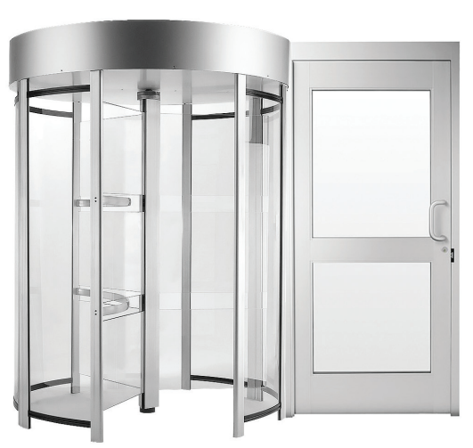
P60 and T36-ADA