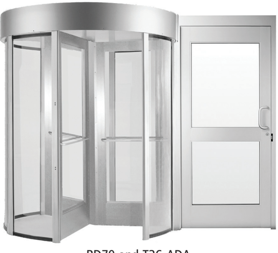
RD70 and T36-ADA