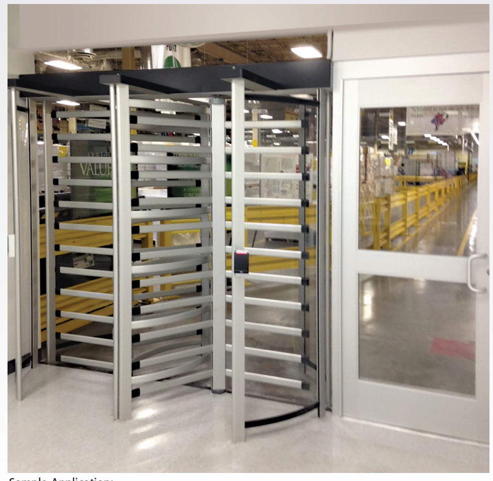
Sample Application: T80-T and T36-ADA door